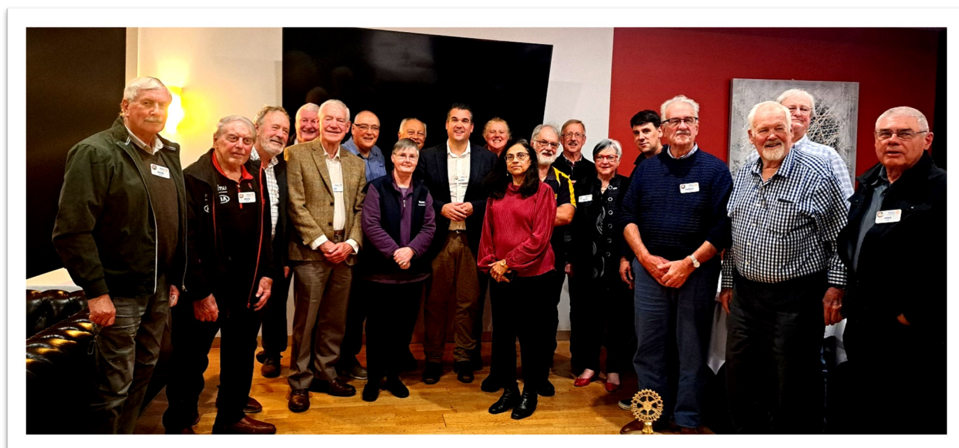
Michael Sukkar with his fellow Rotarians at last weeks meeting.