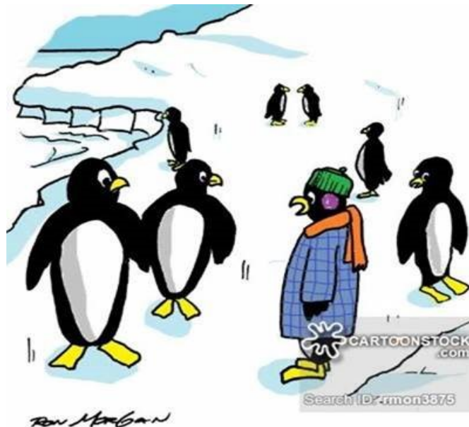
"My mom can be a little over-protective..."