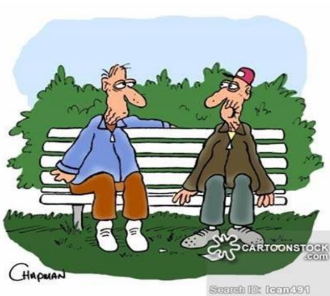
"It was so cold last night, my teeth chattered all night. I finally had to get up and take 'em out of the glass."