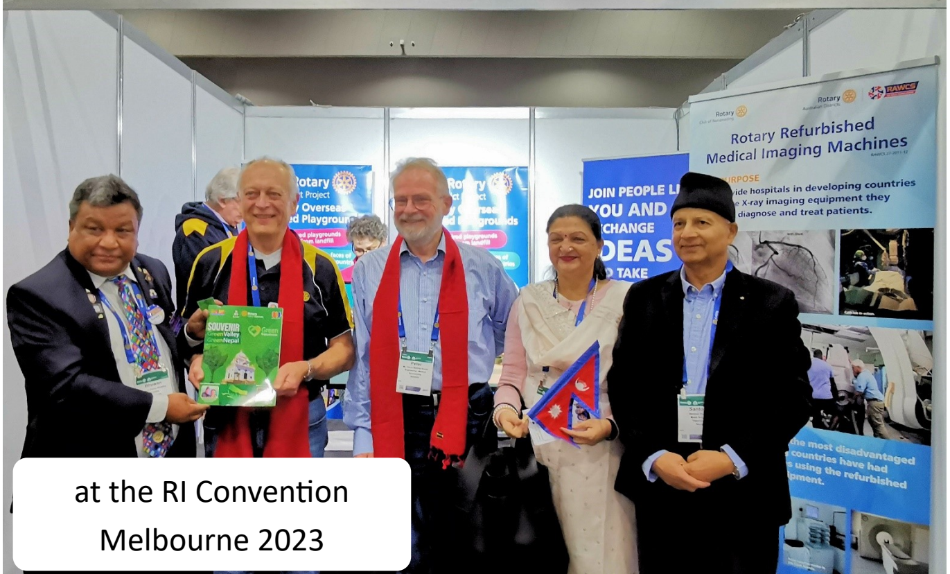
at the RI Convention Melbourne 2023