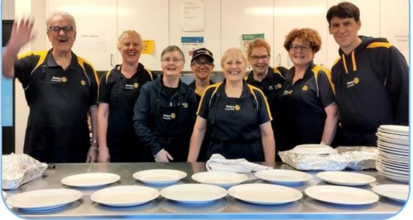
@ the Mitcham Community Meal